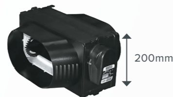
Exact Air Regulator

open in precise increments, that have been proven to provide superior control over the airflow and therefore optimum levels of comfort. In fact, when we developed this product we were awarded with an Australian Designmark Award for innovation - now that's comforting.